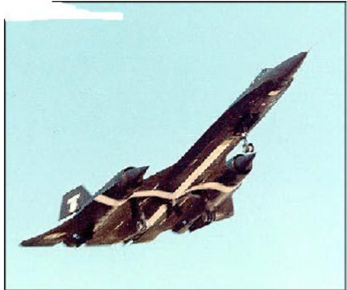
Plane of the Month

I encourage everyone to attend the next club meeting on April 1 st . Remember that the meeting will be held at Livonia's Sheldon Park Senior Center which is located on the east side of Farmington Road just past Plymouth Road. Parking is behind the building and can be accessed via Van Cort drive which lies just north of the senior center. Until then, happy building and flying!