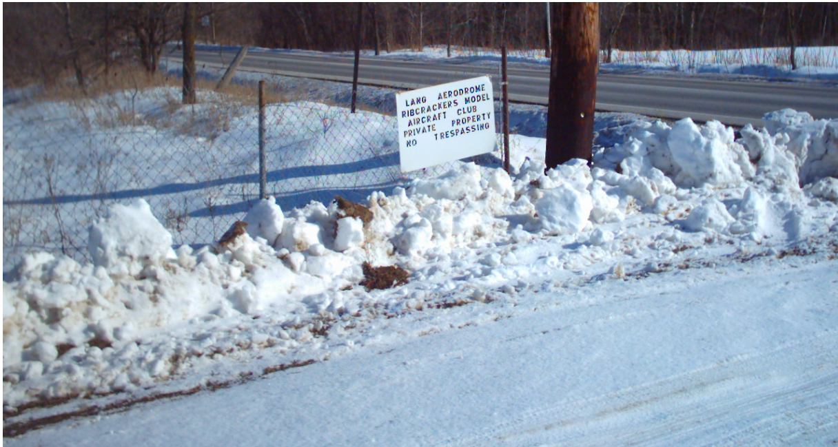
Winter at Lang Aerodrome