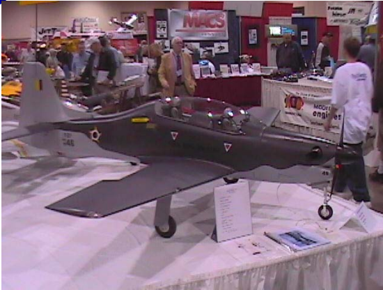
This model is actually powered by a turbo-prop. Very impressive