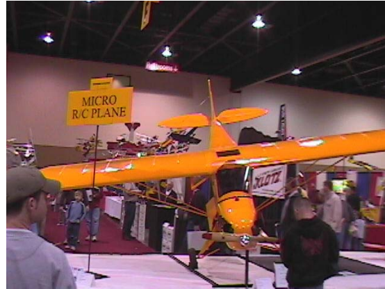
In the wrong category perhaps???