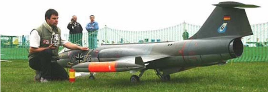
Examples of some extreme models provided by Mike Hegyi