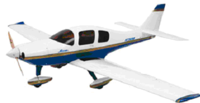
Great Planes Lancair E5 60 ARF .61-.75, 80"