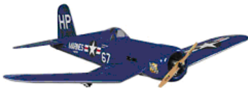
Great Planes Combat Corsair ARF .15-.25, 43.25"