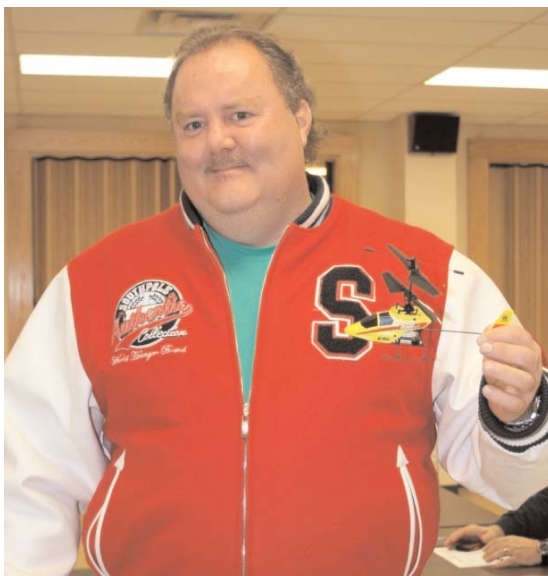
Where's the plane, Dino?